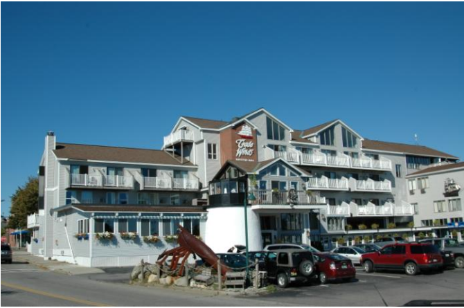
The Trade Winds -- Our Hotel