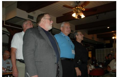
Crew Promotion Ceremony