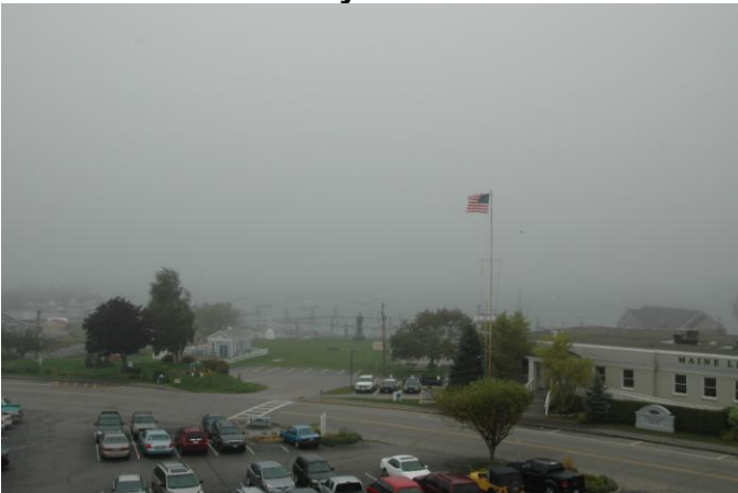
Foggy Morning Harbor View