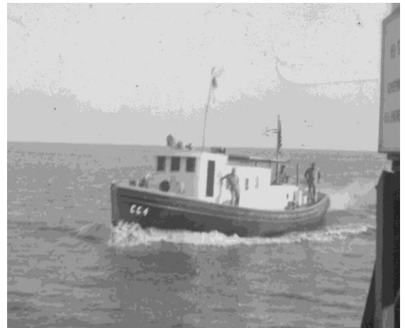
CG-4 an early Harbor Cutter (Small Tug), later classified as AB-4 and finally CG-56003 . Photos from 1930's.