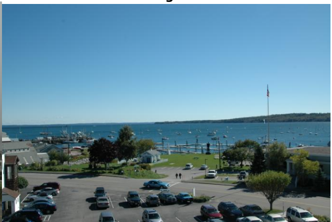
Ah, that's much better.