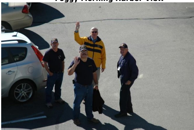
Hi Guys -- See you over there