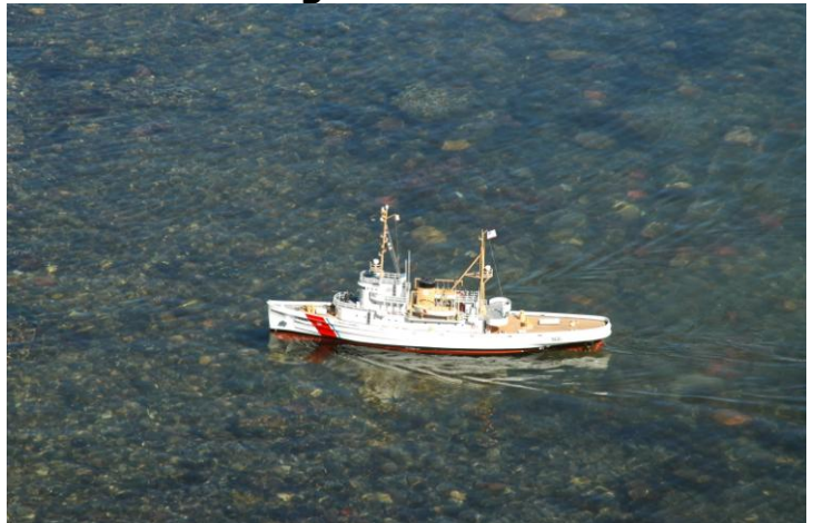
The Real Deal at the Coast Guard Base; 25-foot RB-S & 47-foot MLB