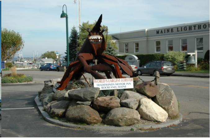
Reportedly the World's Biggest Lobster