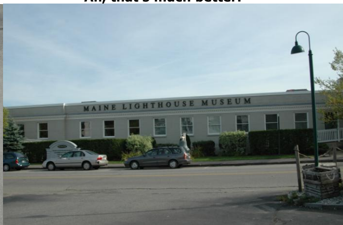
At the Lighthouse Museum