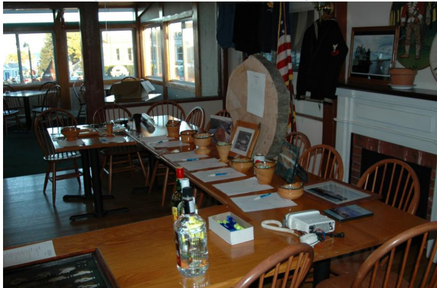
All Set for the Silent Auction.